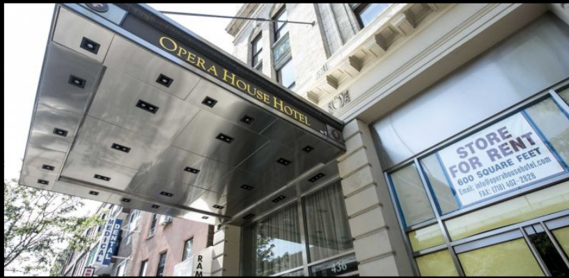
The Opera House Hotel in the Bronx, seen on Aug. 7, 2015, is one of several buildings where the cooling tower tested positive for Legionnaires' disease.